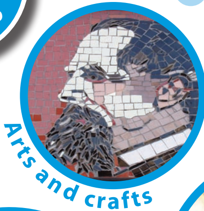
Arts and crafts

Look Inside For Adult Learning Opportunities Near You Tel: 817289